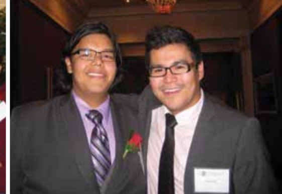
Photos from Award Events in Winnipeg